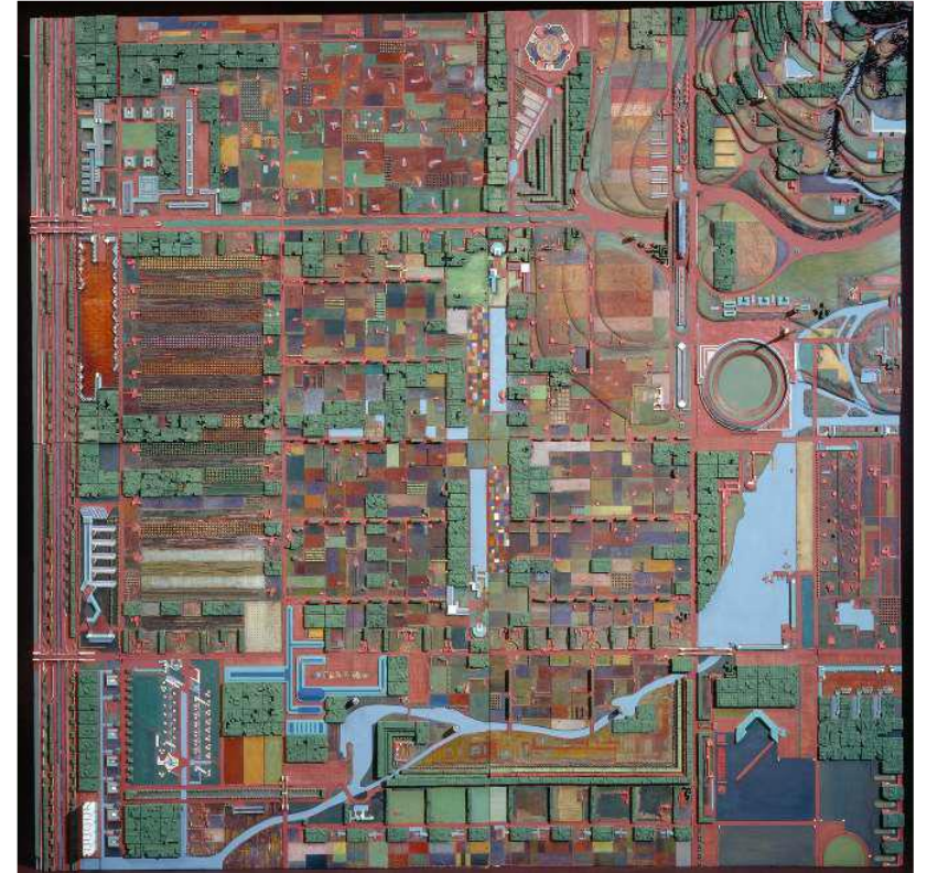
Frank Lloyd Wright's Broadacre City as a classic example of Physical Regional Planning