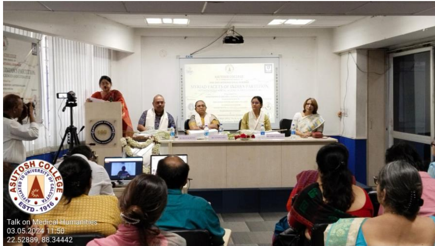
Talk on Medical Humanities 03.05.2024 11:50 22.52889, 88.34442