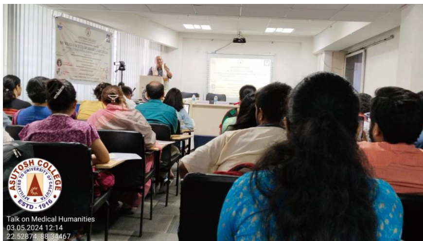
Talk on Medical Humanities 03.05.2024 12:14 22.52874, 88.34467