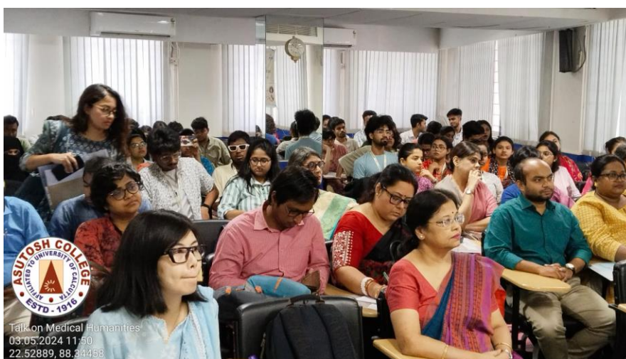
Talk on Medical Humanities 03.05.2024 11:50 22.52889, 88.34458