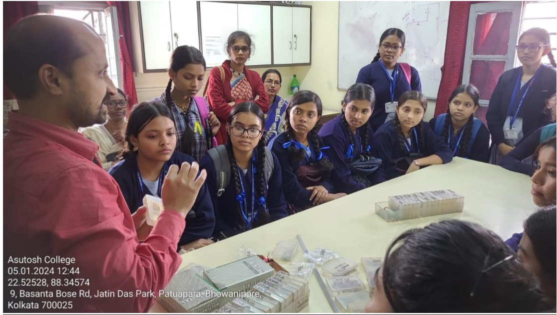
Asutosh College 05.01.2024 12:44 22.52528, 88.34574 9, Basanta Bose Rd, Jatin Das Park, Patuapara, Bhowanipore, Kolkata 700025