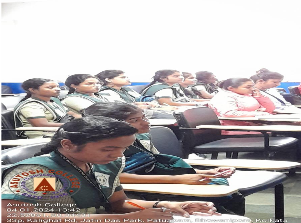
Asutosh College 04.01.2024 13:42 22.52861, 88.34431 33p, Kalighat Rd, Jatin Das Park, Patuapara, Bhowanipore, Kolkata