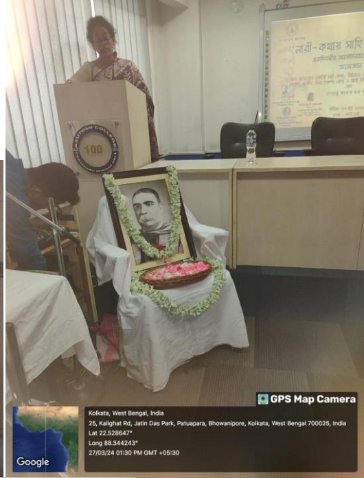
GPS Map Camera Kolkata, West Bengal, India 25, Kalighat Rd, Jatin Das Park, Patuapara, Bhowanipore, Kolkata, West Bengal 700025, India Lat 22.528647° Long 88.344243° 27/03/24 01:30 PM GMT +05:30