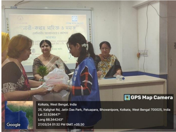
GPS Map Camera Kolkata, West Bengal, India 25, Kalighat Rd, Jatin Das Park, Patuapara, Bhowanipore, Kolkata, West Bengal 700025, India Lat 22.528647° Long 88.344243° 27/03/24 01:32 PM GMT +05:30