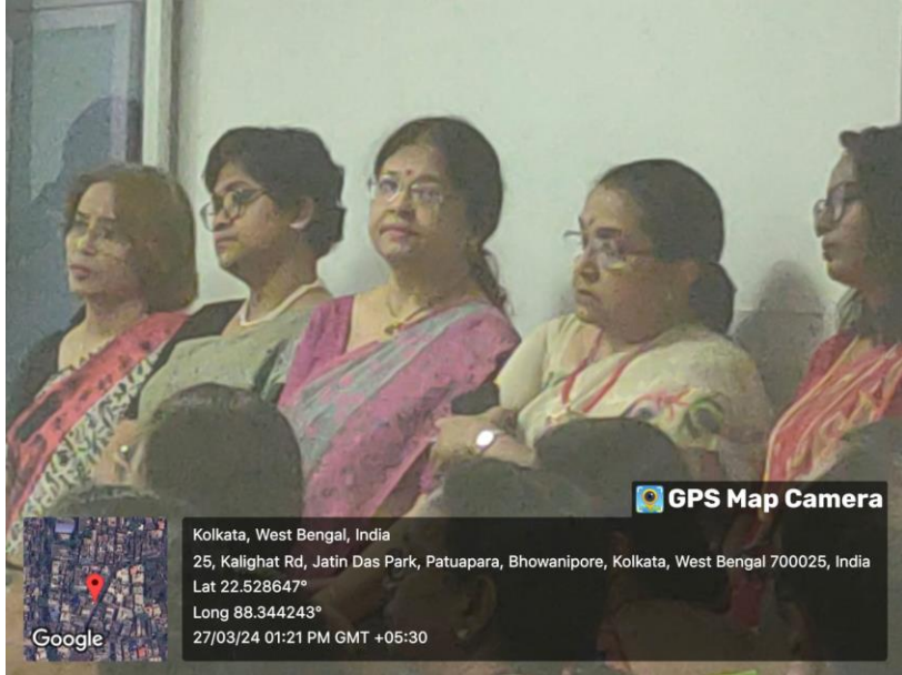
GPS Map Camera Kolkata, West Bengal, India 25, Kalighat Rd, Jatin Das Park, Patuapara, Bhowanipore, Kolkata, West Bengal 700025, India Lat 22.528647° Long 88.344243° 27/03/24 01:21 PM GMT +05:30