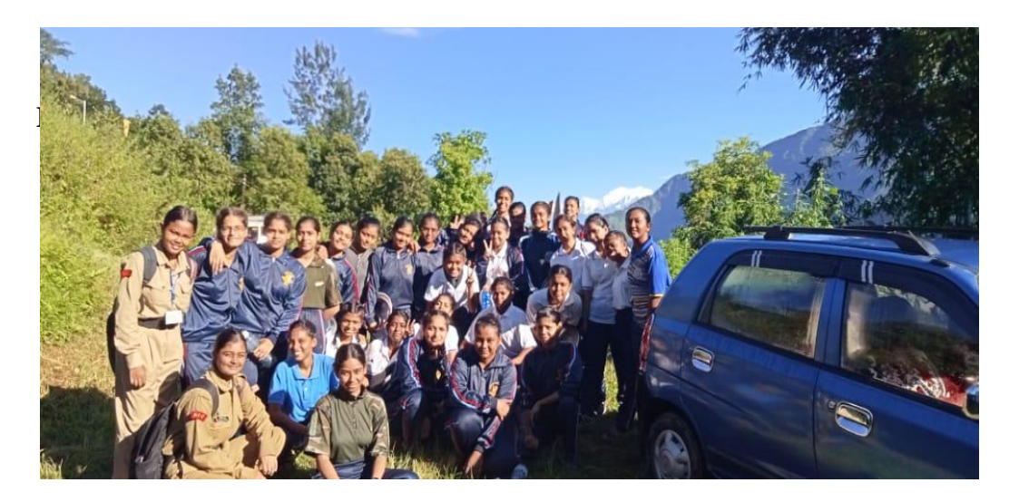
PRINCIPAL ASUTOSH COLLEGE 92, S. P. MUKHERJEE ROAD KOLKATA-700 026