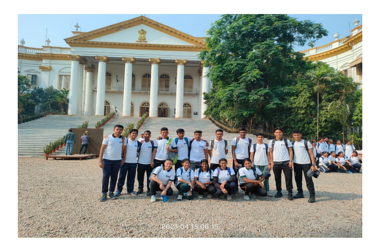
PRINCIPAL ASUTOSH COLLEGE 92, S. P. MUKHERJEE ROAD KOLKATA-700 026