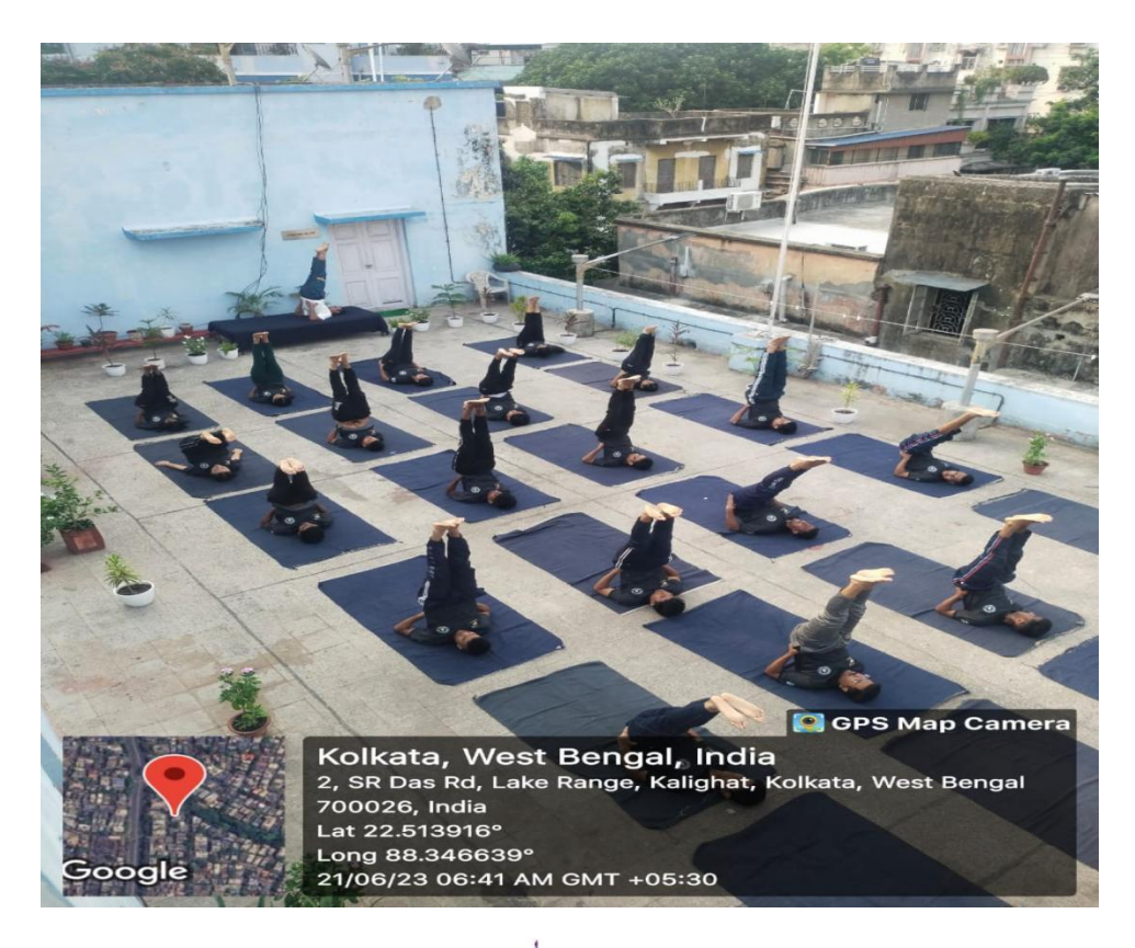
PRINCIPAL ASUTOSH COLLEGE 92, S. P. MUKHERJEE ROAD KOLKATA-700 026