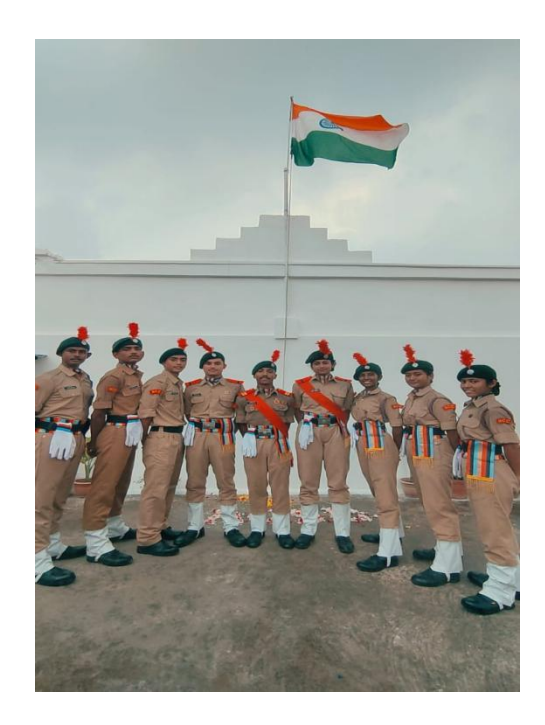
PRINCIPAL ASUTOSH COLLEGE 92, S. P. MUKHERJEE ROAD KOLKATA-700 026