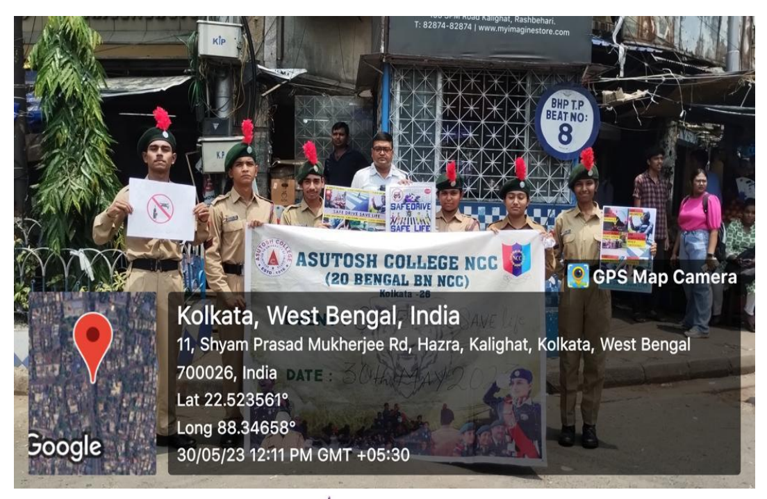
PRINCIPAL ASUTOSH COLLEGE 92, S. P. MUKHERJEE ROAD KOLKATA-700 026