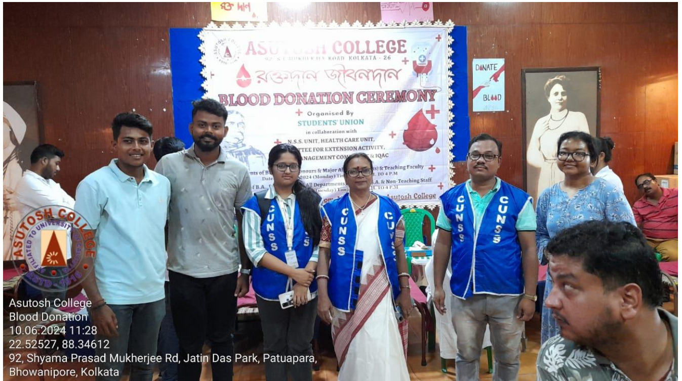
Asutosh College Blood Donation 10.06.2024 11:28 22.52527, 88.34612 92, Shyama Prasad Mukherjee Rd, Jatin Das Park, Patuapara, Bhowanipore, Kolkata