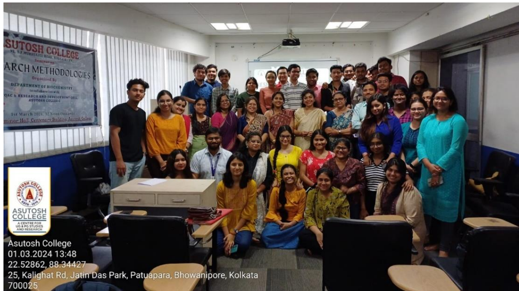
Asutosh College 01.03.2024 13:48 22.52862, 88.34427 25, Kalighat Rd, Jatin Das Park, Patuapara, Bhowanipore, Kolkata 700025