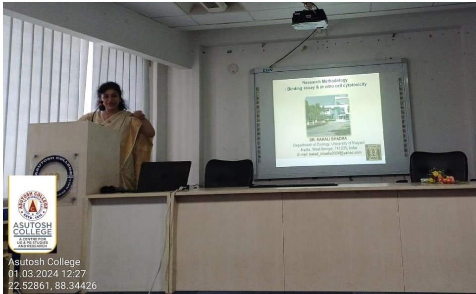
Asutosh College 01.03.2024 12:27 22.52861, 88.34426