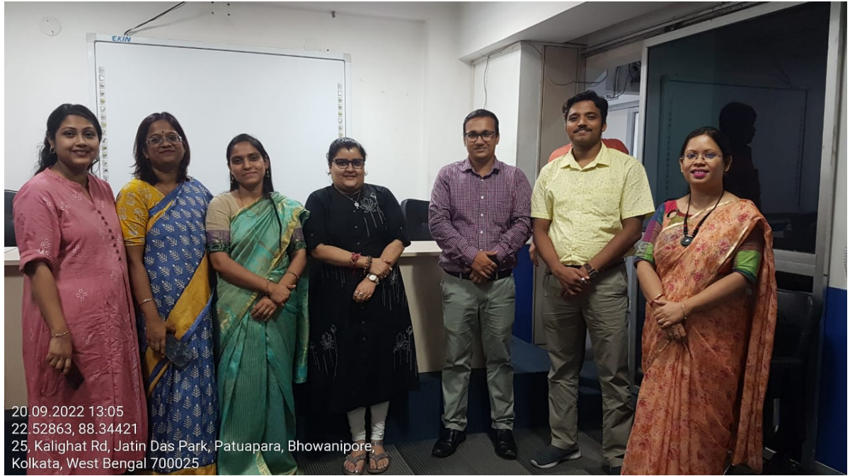
20.09.2022 13:05 22.52863, 88.34421 25, Kalighat Rd, Jatin Das Park, Patuapara, Bhowanipore, Kolkata, West Bengal 700025