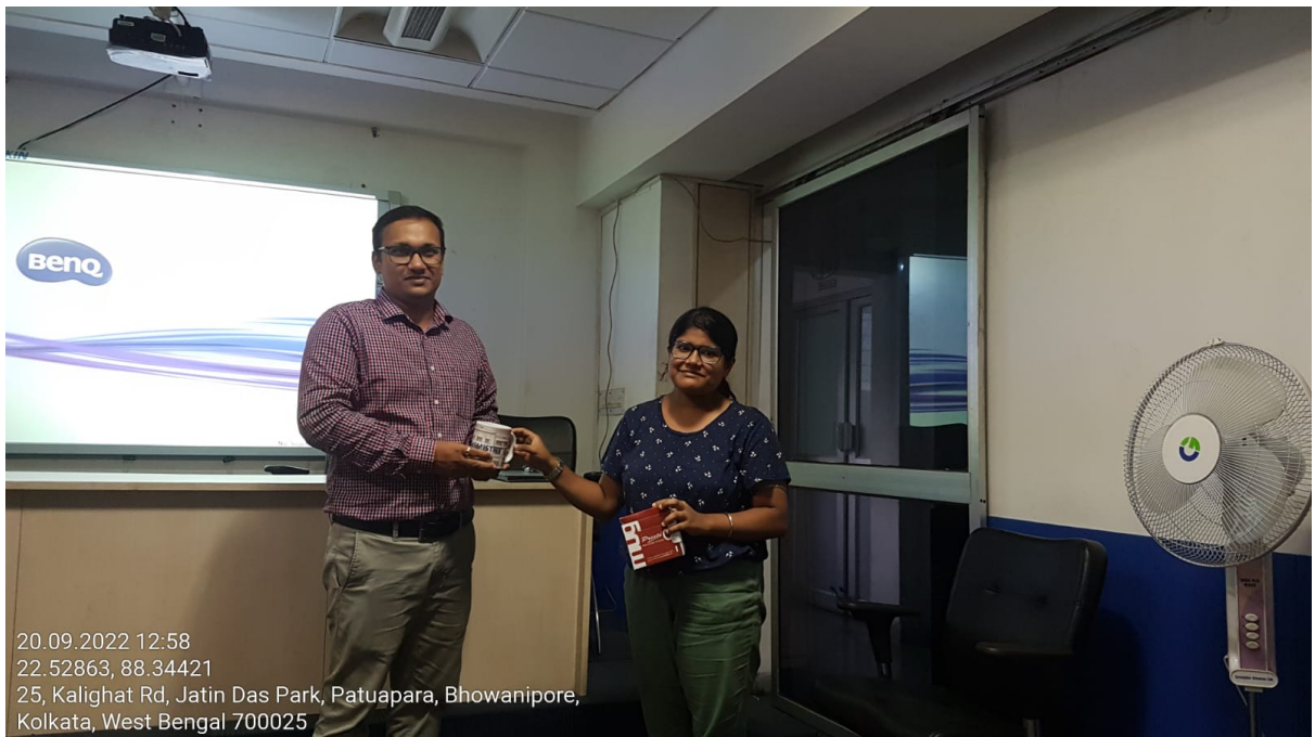
20.09.2022 12:58 22.52863, 88.34421 25, Kalighat Rd, Jatini Das Park, Patuapara, Bhowanipore, Kolkata, West Bengal 700025