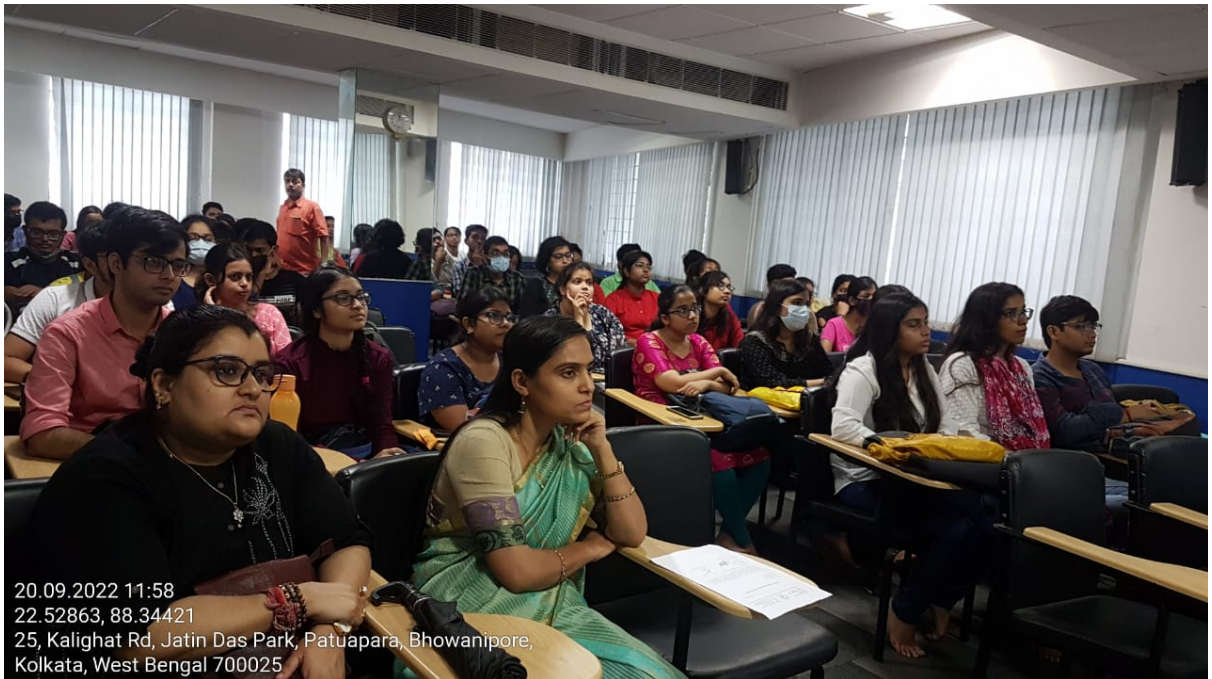
20.09.2022 11:58 22.52863, 88.34421 25, Kalighat Rd, Jatin Das Park, Patuapara, Bhowanipore, Kolkata, West Bengal 700025