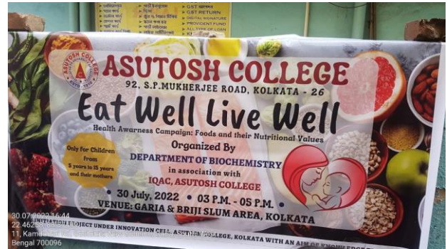
30.07.2022 17:46 22.46278, 88.37456 11, Kamadahan, Gostotala New Scheme, Kamadahan, Garia, Kolkata, West Bengal 700096