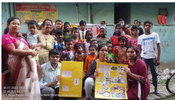
30.07.2022 16:41 22.46293, 88.37496 L1, Keya Bagan Rd, Gostotala New Scheme, Bramhanur, Kolkata, West Bengal 700098