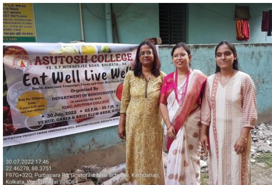
30.07.2022 17:46 22.46278, 88.3751 F97G+32Q, Purbapara Rd, Gostotala New Scheme, Kamadahan, Kolkata, West Bengal 700094