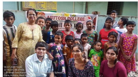
30.07.2022 16:46 22.46231, 88.37456 L55 Bose Para,Kamradan, Gostotala New Scheme, Garia, Kolkata, West Bengal 700096