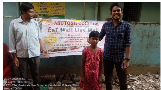
30.07.2022 16:50 22.46278, 88.37506 #97F+3XW, Gostotala New Scheme, Kamadahan, Kolkata, West Bengal 700094

PRINCIPAL ASUTOSH COLLEGE 92, S. P. MUKHERJEE ROAD KOLKATA-700 026