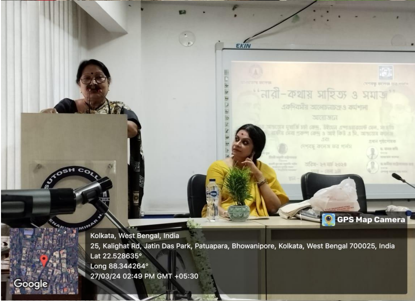
Kolkata, West Bengal, India 25, Kalighat Rd, Jatin Das Park, Patuapara, Bhowanipore, Kolkata, West Bengal 700025, India Lat 22.528635° Long 88.344264° 27/03/24 02:49 PM GMT +05:30