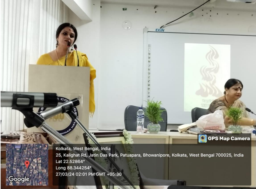
Kolkata, West Bengal, India 25, Kalighat Rd, Jatin Das Park, Patuapara, Bhowanipore, Kolkata, West Bengal 700025, India Lat 22.52864° Long 88.344254° 27/03/24 02:01 PM GMT +05:30