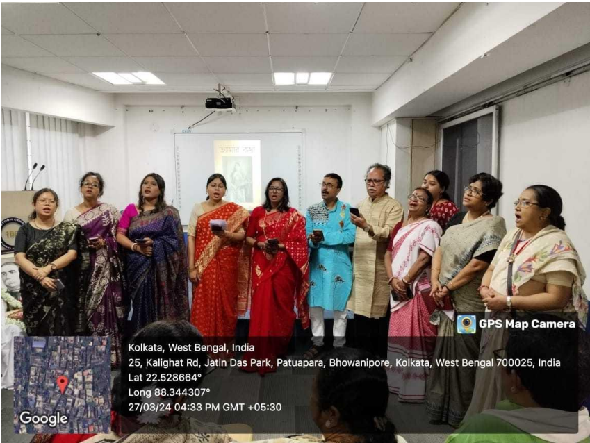
Kolkata, West Bengal, India 25, Kalighat Rd, Jatin Das Park, Patuapara, Bhowanipore, Kolkata, West Bengal 700025, India Lat 22.528664° Long 88.344307° 27/03/24 04:33 PM GMT +05:30