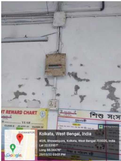
Bhowanipur Girls High School