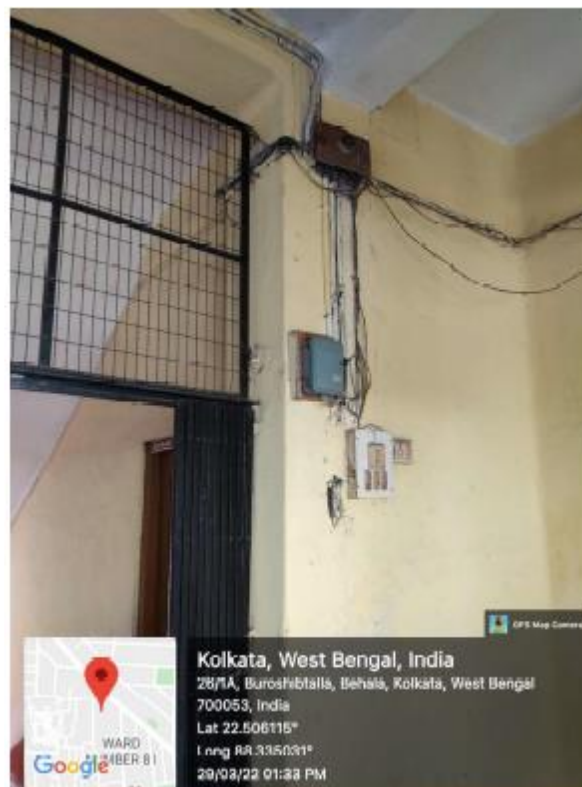
Sahapur Mathuranath Vidyapith (HS)