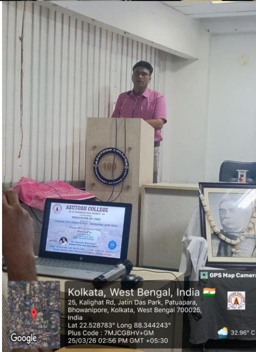
Kolkata, West Bengal, India 25, Kalighat Rd, Jatin Das Park, Patuapara, Bhowanipore, Kolkata, West Bengal 700025, India Lat 22.528783° Long 88.344243° Plus Code : 7MJCG8HV+GM 25/03/26 02:56 PM GMT +05:30 32.96° C