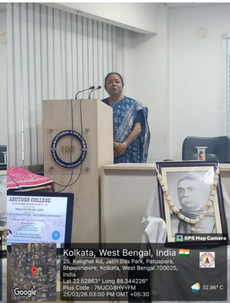
Kolkata, West Bengal, India 25, Kalighat Rd, Jatin Das Park, Patuapara, Bhowanipore, Kolkata, West Bengal 700025, India Lat 22.52863° Long 88.344226° Plus Code : 7MJCG8HV+FM 25/03/26 03:00 PM GMT +05:30 32.96° C