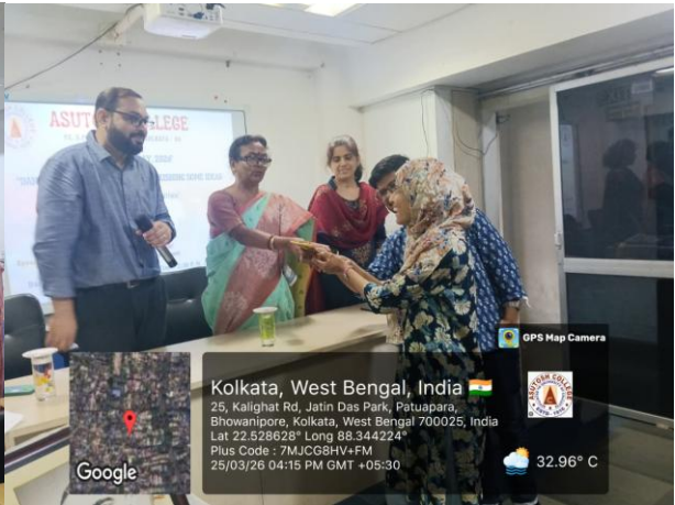
Kolkata, West Bengal, India 25, Kalighat Rd, Jatin Das Park, Patuapara, Bhowanipore, Kolkata, West Bengal 700025, India Lat 22.528628° Long 88.344224° Plus Code : 7MJCG8HV+FM 25/03/26 04:15 PM GMT +05:30 32.96° C