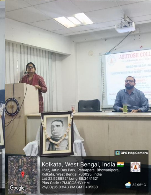
Kolkata, West Bengal, India 16/2, Jatin Das Park, Patuapara, Bhowanipore, Kolkata, West Bengal 700025, India Lat 22.528982° Long 88.344132° Plus Code : 7MJCG8HV+HM 25/03/26 03:43 PM GMT +05:30 32.96° C