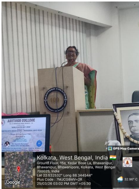
Kolkata, West Bengal, India Ground Floor, 15a, Kedar Bose La, Bhowanipur, Bhowanipur, Kolkata, West Bengal 700025, India Lat 22.532532° Long 88.344544° Plus Code : 7MJCG8MV+2R 25/03/26 03:02 PM GMT +05:30 32.96° C