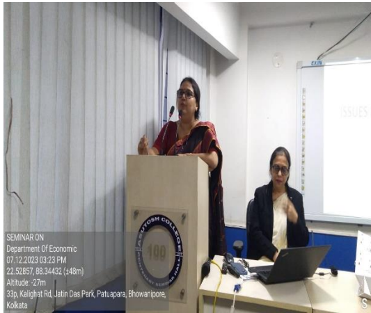
SEMINAR ON Department Of Economic 07.12.2023 03:23 PM 22.52857, 88.34432 (+48m) Altitude: -27m 33p, Kalighat Rd, Jatin Das Park, Patuapara, Bhowanipore, Kolkata