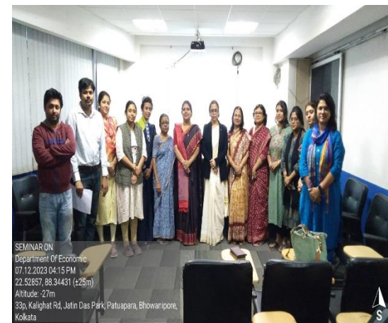
SEMINAR ON Department Of Economic 07.12.2023 04:15 PM 22.52857, 88.34431 (+25m) Altitude: -27m 33p, Kalighat Rd, Jatin Das Park, Patuapara, Bhowanipore, Kolkata