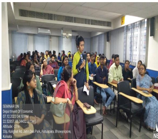
SEMINAR ON Department Of Economic 07.12.2023 04:10 PM 22.52857, 88.34432 (+13m) Altitude: -27m 33p, Kalighat Rd, Jatin Das Park, Patuapara, Bhowanipore, Kolkata