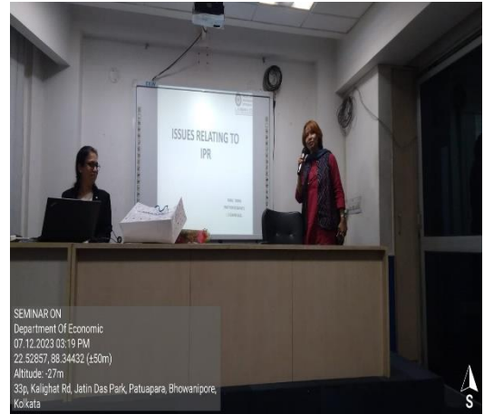
SEMINAR ON Department Of Economic 07.12.2023 03:19 PM 22.52857, 88.34432 (+50m) Altitude: -27m 33p, Kalighat Rd, Jatin Das Park, Patuapara, Bhowanipore, Kolkata