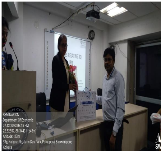
SEMINAR ON Department Of Economic 07.12.2023 03:18 PM 22.52857, 88.34431 (+48m) Altitude: -27m 33p, Kalighat Rd, Jatin Das Park, Patuapara, Bhowanipore, Kolkata