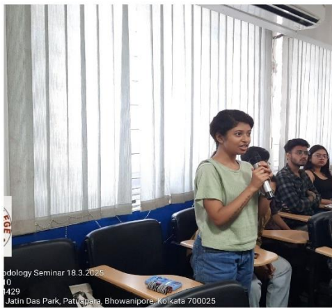
Research Methodology Seminar 18.3.2025 13:10 22.52862, 88.34428 25, Kalighat Rd, Jatin Das Park, Patuapara, Bhowanipore, Kolkata 700025