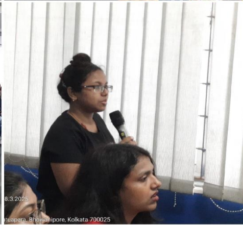
Research Methodology Seminar 18.3.2025 13:10 22.52862, 88.34428 25, Kalighat Rd, Jatin Das Park, Patuapara, Bhowanipore, Kolkata 700025