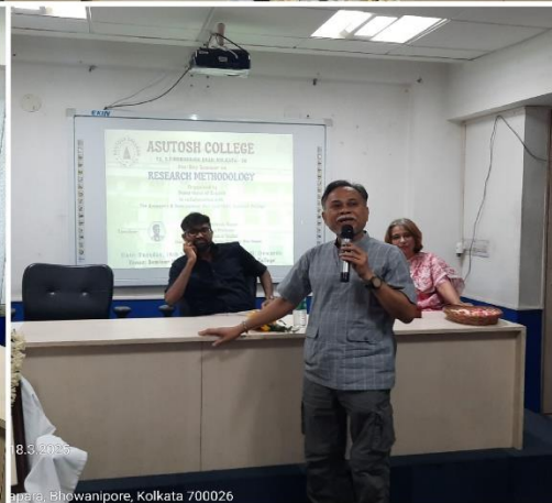
18.03.2025 Patuapara, Bhowanipore, Kolkata 700026