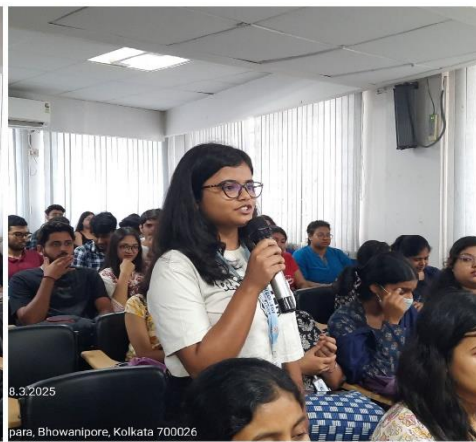
Research Methodology Seminar 18.3.2025 13:10 22.52862, 88.34428 25, Kalighat Rd, Jatin Das Park, Patuapara, Bhowanipore, Kolkata 700026