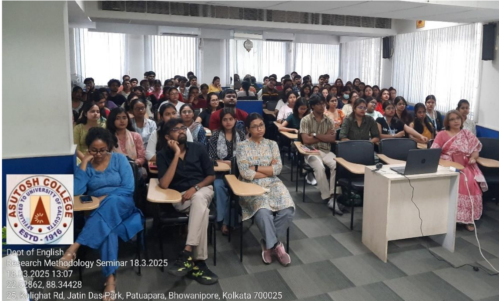
Dept of English Research Methodology Seminar 18.3.2025 18.03.2025 13:07 22.52862, 88.34428 25, Kalighat Rd, Jatin Das Park, Patuapara, Bhowanipore, Kolkata 700025