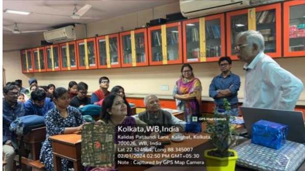
Kolkata, WB, India Kalidas Pattanai Lane, Kalighat, Kolkata, 700026, WB, India Lat 22.524586, Long 88.345007 02/01/2024 02:50 PM GMT +05:30 Note : Captured by GPS Map Camera