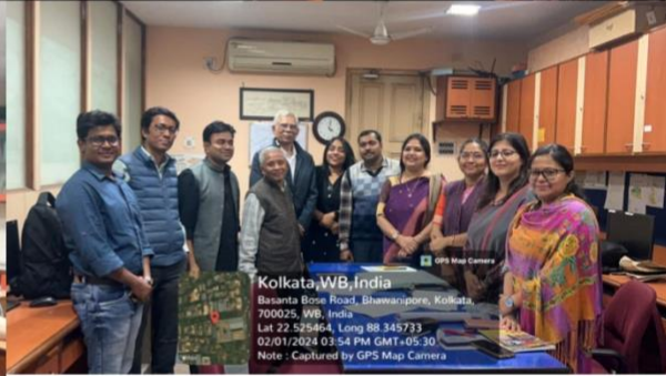
Kolkata, WB, India Basanta Bose Road, Bhowanipore, Kolkata, 700025, WB, India Lat 22.525464, Long 88.345733 02/01/2024 03:54 PM GMT +05:30 Note : Captured by GPS Map Camera