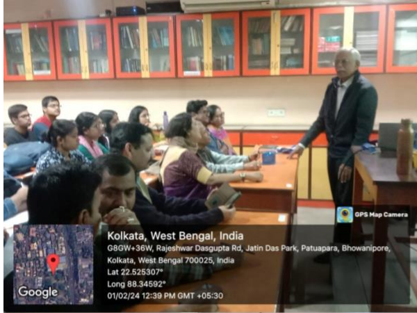
Kolkata, West Bengal, India G8GW+36W, Rajeshwar Dasgupta Rd, Jatin Das Park, Patuapara, Bhowanipore, Kolkata, West Bengal 700025, India Lat 22.525307° Long 88.34592° 01/02/24 12:39 PM GMT +05:30