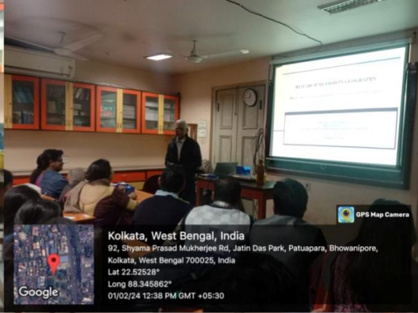
Kolkata, West Bengal, India 92, Shyama Prasad Mukherjee Rd, Jatin Das Park, Patuapara, Bhowanipore, Kolkata, West Bengal 700025, India Lat 22.52528° Long 88.345862° 01/02/24 12:38 PM GMT +05:30