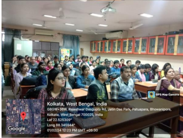
Kolkata, West Bengal, India G8GW+36W, Rajeshwar Dasgupta Rd, Jatin Das Park, Patuapara, Bhowanipore, Kolkata, West Bengal 700025, India Lat 22.525309° Long 88.345944° 01/02/24 12:23 PM GMT +05:30