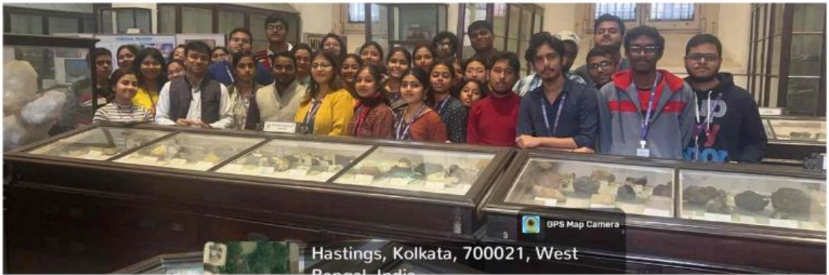
Hastings, Kolkata, 700021, West Bengal, India