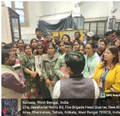
Kolkata, West Bengal, India 25a, Jawaharlal Nehru Rd, Fire Brigade Head Quarter, New Market Area, Dharmatala, Taltala, Kolkata, West Bengal 700016, India