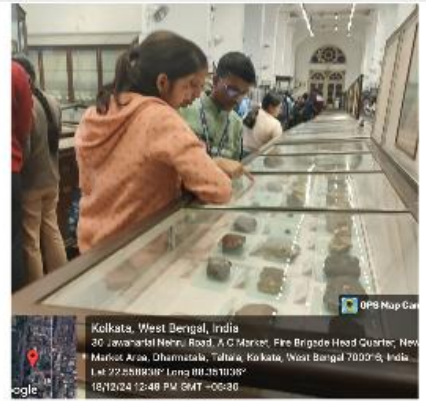
Kolkata, West Bengal, India 30 Jawaharlal Nehru Road, A.C Market, Fire Brigade Head Quarter, New Market Area, Dharmatala, Taltala, Kolkata, West Bengal 700016, India Lat 22.558013° Long 88.351038° 18/12/24 12:48 PM GMT +05:30