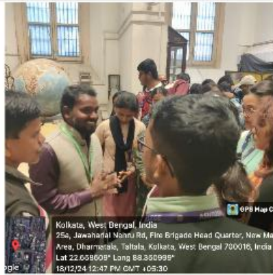
Kolkata, West Bengal, India 25a, Jawaharlal Nehru Rd, Fire Brigade Head Quarter, New Market Area, Dharmatala, Taltala, Kolkata, West Bengal 700016, India Lat 22.558009° Long 88.350998° 18/12/24 12:47 PM GMT +05:30