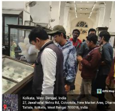
Kolkata, West Bengal, India 27, Jawaharlal Nehru Rd, Colootola, New Market Area, Dharmatala, Kolkata, West Bengal 700016, India