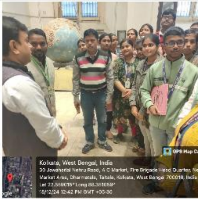
Kolkata, West Bengal, India 30 Jawaharlal Nehru Road, A.C Market, Fire Brigade Head Quarter, New Market Area, Dharmatala, Taltala, Kolkata, West Bengal 700016, India Lat 22.558013° Long 88.351038° 18/12/24 12:42 PM GMT +05:30