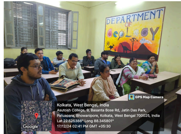
Faculty-Guardian Interaction: 3rd Semester