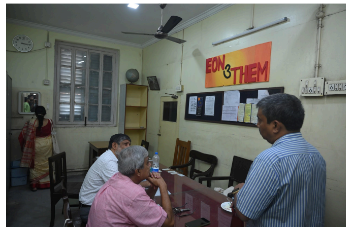
Alumni interaction, activities, lunch