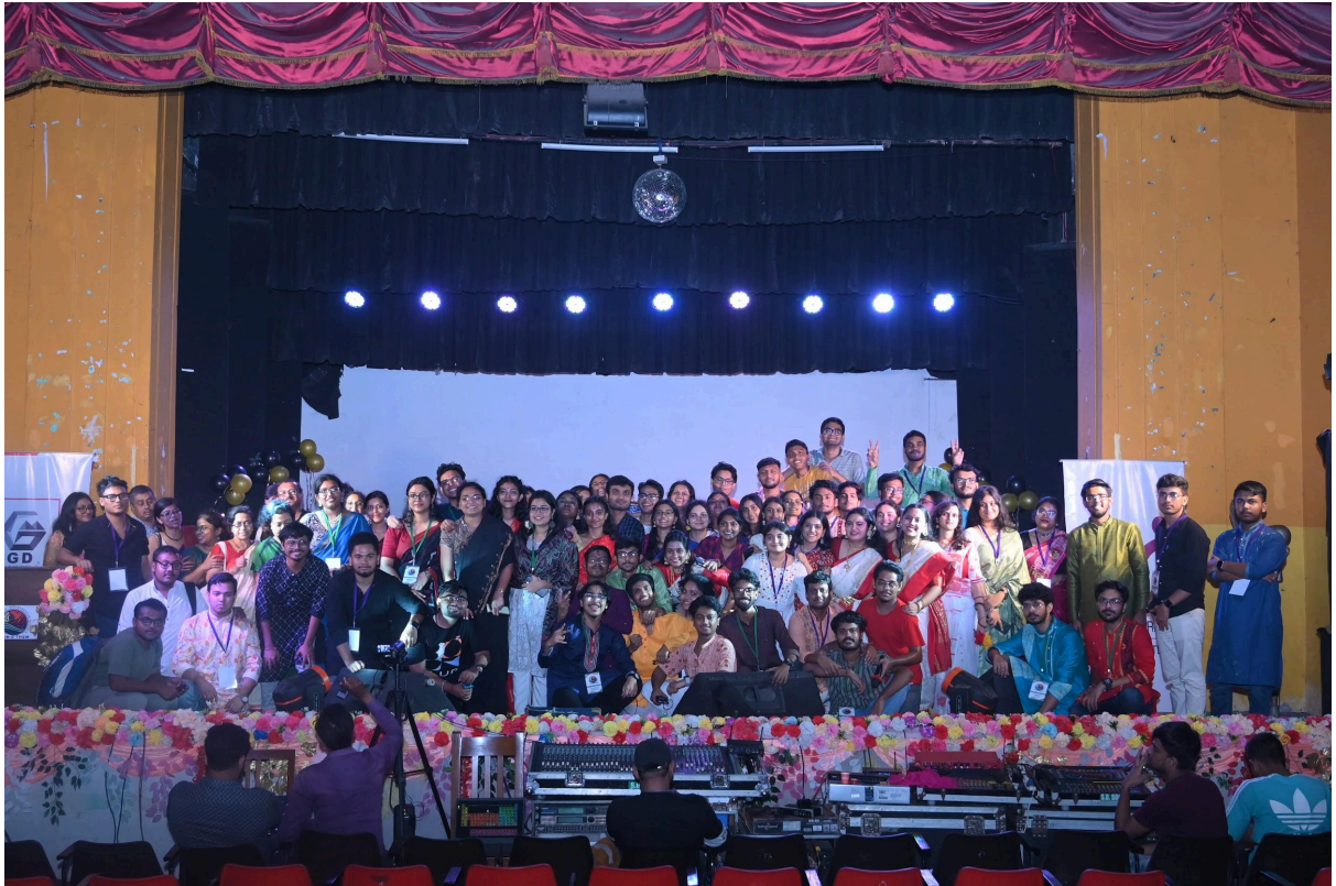
Organising members of Eon-o-them 2024