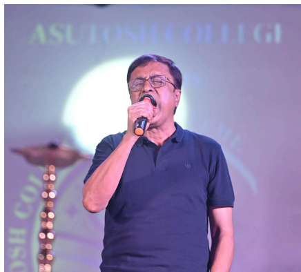
Reminiscing and performances by alumni members