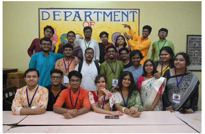
Reception Desk and volunteers