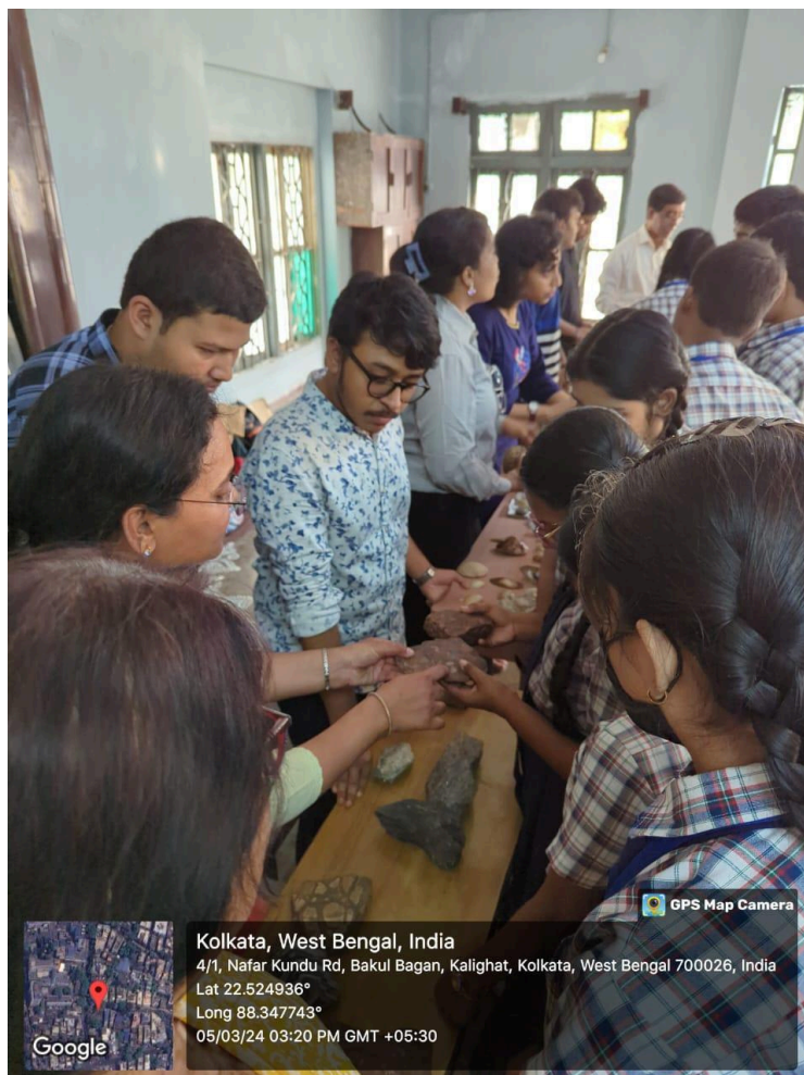
Figure 4: Demonstration of different rock types to the students