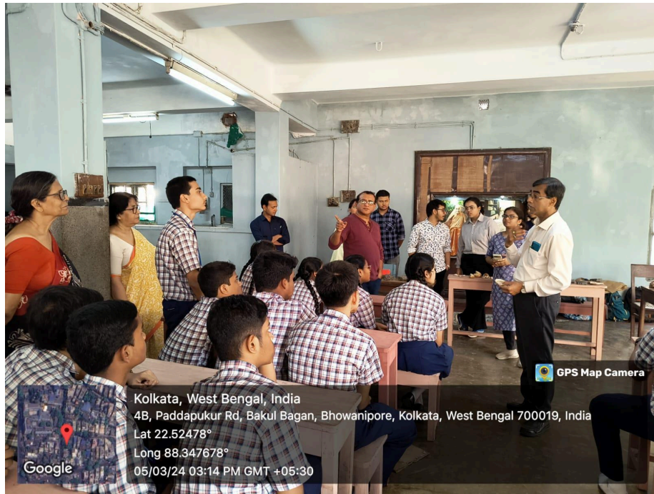
Figure 5: Interactive Q/A session with the speakers and the students