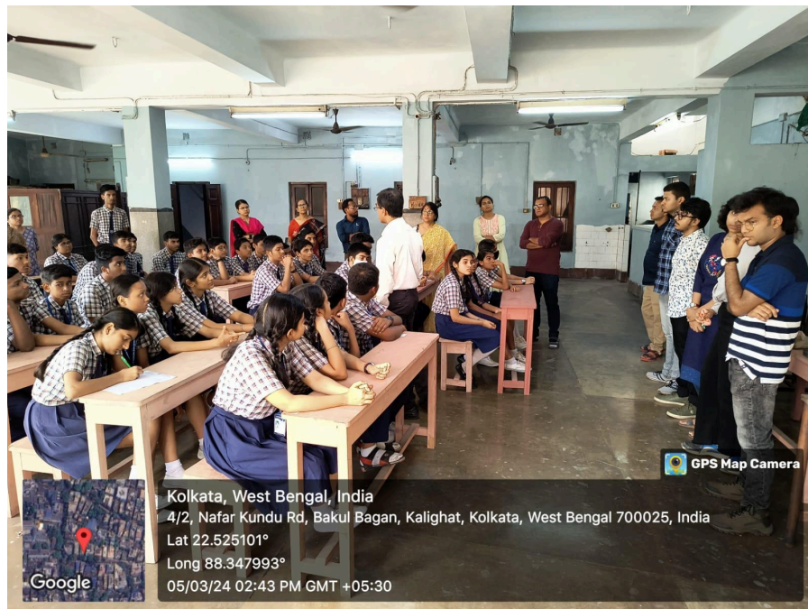
Figure 1: Introducing the concepts and prospects of geology to the students