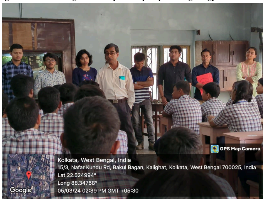
Figure 2: Introducing the concepts and prospects of geology to the students