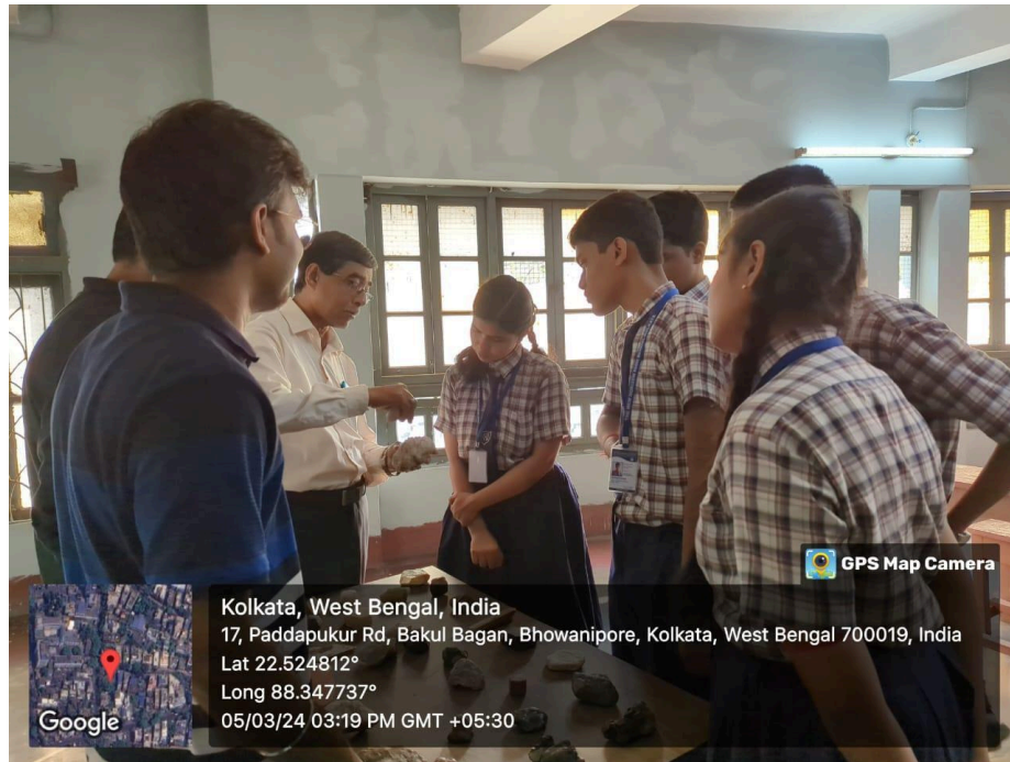
Figure 3: Demonstration of geological specimens to the students