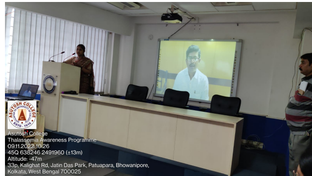
Asutosh College Thalassaemia Awareness Programme 09.11.2022 10:26 45Q 638246 2491960 (±13m) Altitude: -47m 33p, Kallighat Rd, Jatin Das Park, Patuapara, Bhowanipore, Kolkata, West Bengal 700025