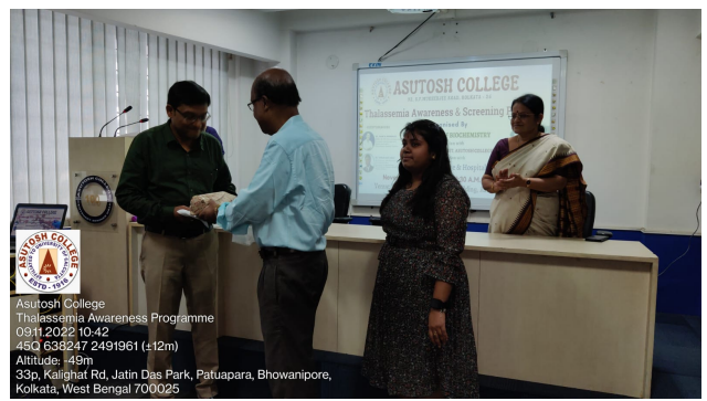
Asutosh College Thalassaemia Awareness Programme 09.11.2022 10:42 45Q 638247 2491961 (±12m) Altitude: -49m 33p, Kallighat Rd, Jatin Das Park, Patuapara, Bhowanipore, Kolkata, West Bengal 700025