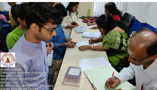
Asutosh College Thalassaemia Awareness Programme 09.11.2022 13:27 45Q 638245 2491963 (±14m) Altitude: -48m 25, Kallighat Rd, Jatin Das Park, Patuapara, Bhowanipore, Kolkata, West Bengal 700025