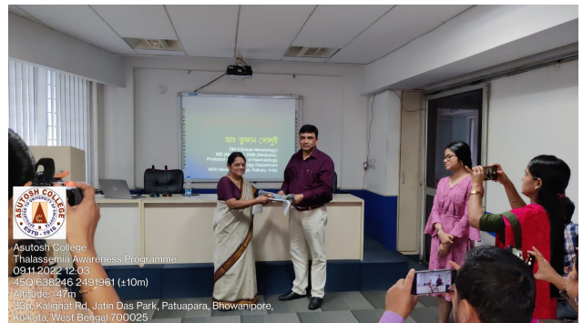
Asutosh College Thalassaemia Awareness Programme 09.11.2022 12:03 45Q 638246 2491961 (±10m) Altitude: -47m 33p, Kallighat Rd, Jatin Das Park, Patuapara, Bhowanipore, Kolkata, West Bengal 700025