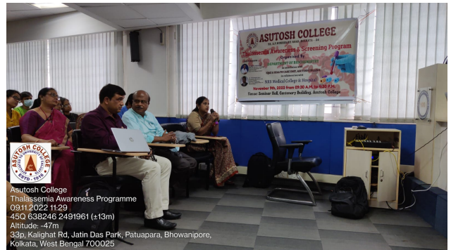
Asutosh College Thalassaemia Awareness Programme 09.11.2022 11:29 45Q 638246 2491961 (±13m) Altitude: -47m 33p, Kallighat Rd, Jatin Das Park, Patuapara, Bhowanipore, Kolkata, West Bengal 700025