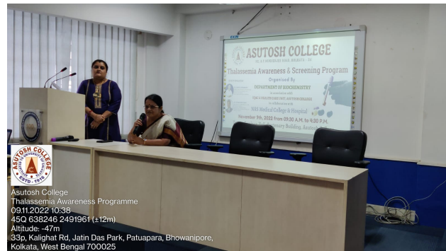
Asutosh College Thalassaemia Awareness Programme 09.11.2022 10:38 45Q 638246 2491960 (±12m) Altitude: -47m 33p, Kallighat Rd, Jatin Das Park, Patuapara, Bhowanipore, Kolkata, West Bengal 700025