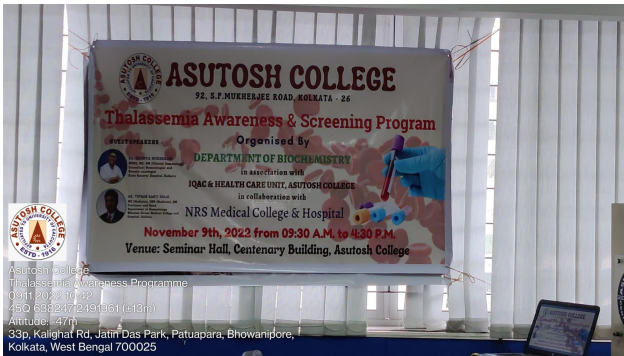
Asutosh College Thalassaemia Awareness Programme 09.11.2022 10:42 45Q 638246 2491961 (±13m) Altitude: -47m 33p, Kallighat Rd, Jatin Das Park, Patuapara, Bhowanipore, Kolkata, West Bengal 700025