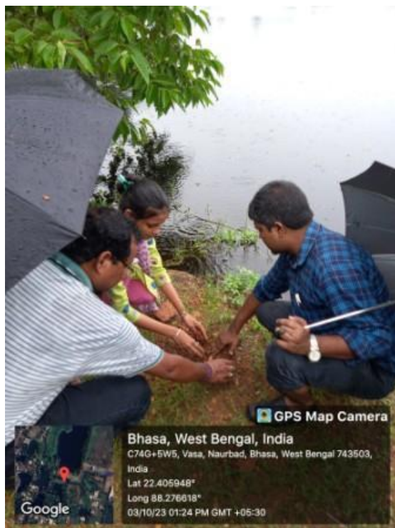
Image 7: Fertilizing the soil by faculty member, Non teaching staff and students