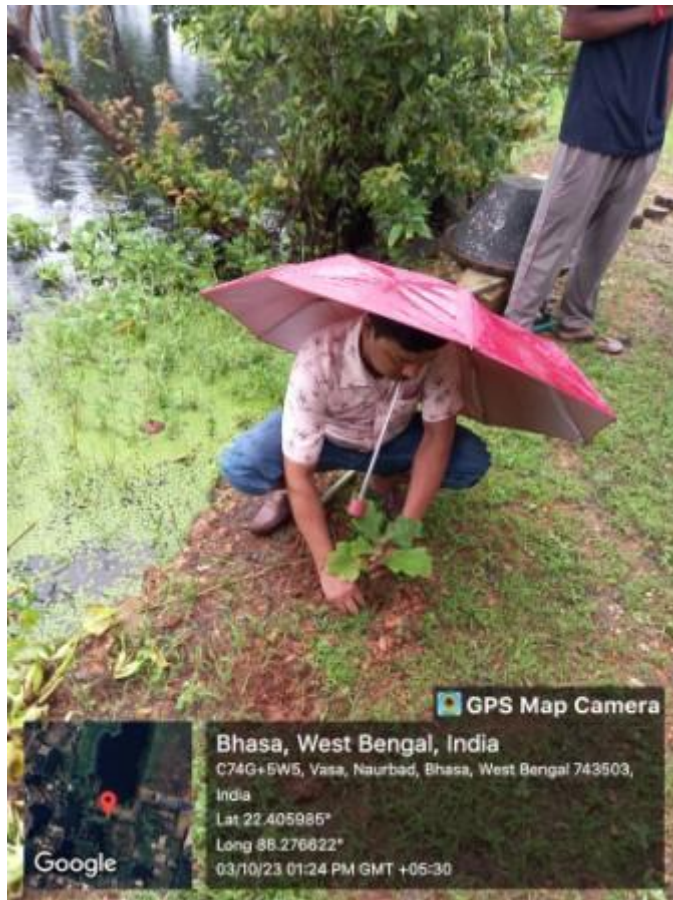
Image 8: Plantation to the pond dyke by faculty members and students