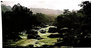
"A rushing river flows"

Rev. Fr. M. J. P. S. M. J. P. S. M. J. P. S. M. J. P. S. M. J. P. S. M. J. P. S. M. J. P. S. M. J. P. S.