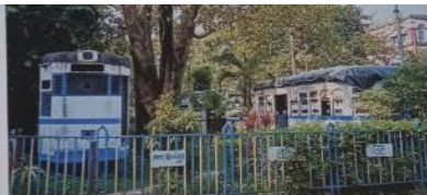
Kolkata's iconic trams, once a symbol of the city's heritage, now come to a quiet halt, marking the end of an era

8/12/25 Dept. of Journalism & Mass Communication Asutosh College, Kolkata