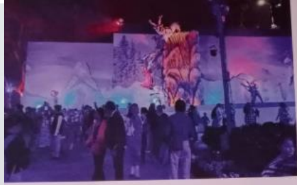
Frozen themed decoration with Elsa, Anna, Kristoff, Sven, Hans and Olaf

289. 18/3/25 Head of the Department of Journalism & Mass Communication Kolkata