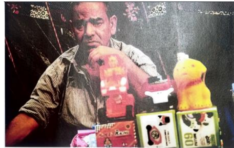
SORROWNESS & CHILDHOOD GRANTOR

8/12/25 Dept. of Journalism & Mass Communication Asutosh College, Kolkata