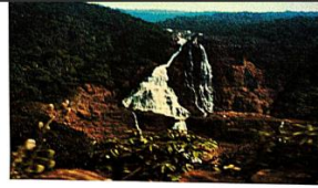
"Majestic falls, timeless beauty"

Dept. of Journalism & Mass Communication Asutosh College, Kolkata