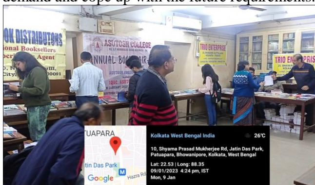
Reading Library, ACTC Building

On 9 th January ,2023, Monday hundreds of our academic community members visit enthusiastically the Annual Book Fair cum Book Exhibition 2023 at the Reading library of ACTC Building along with the Central Library, Main building . The renowned book distributors like Trio Enterprise, Bharat Books Distributor, S. B. Enterprise, B. Bros. & Co., K. M. Enterprise, Unique Books , Platform Book Centre etc. exhibited books from publishers of international, national and locally reputed publishers to meet the academic thirst of our students, faculty members and others. The event offered a unique approach before the academic community to interact among the stakeholders like publishers, vendors, writers and readers. From the book fair books for all departments have been selected and purchased to cater the current demand and cope up with the future requirements.