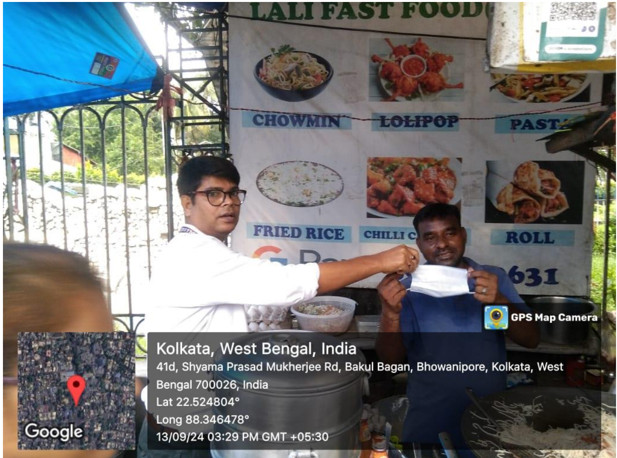
Kolkata, West Bengal, India 41d, Shyama Prasad Mukherjee Rd, Bakul Bagan, Bhowanipore, Kolkata, West Bengal 700026, India Lat 22.524804° Long 88.346478° 13/09/24 03:29 PM GMT +05:30