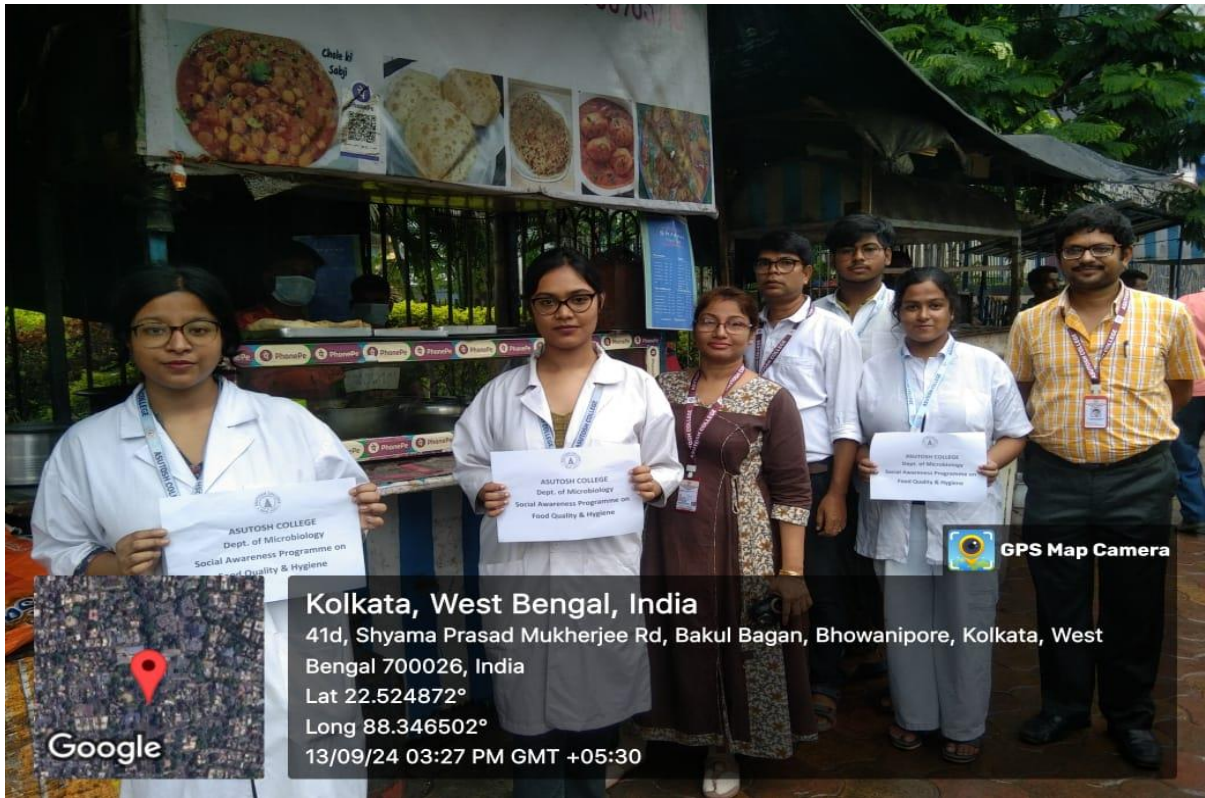
Kolkata, West Bengal, India 41d, Shyama Prasad Mukherjee Rd, Bakul Bagan, Bhowanipore, Kolkata, West Bengal 700026, India Lat 22.524872° Long 88.346502° 13/09/24 03:27 PM GMT +05:30