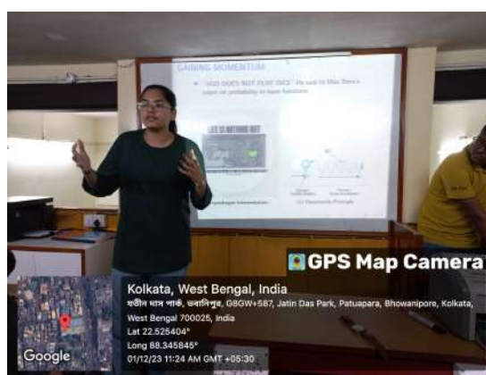
Explanation leading to establishment of the viewpoint of the taken Project