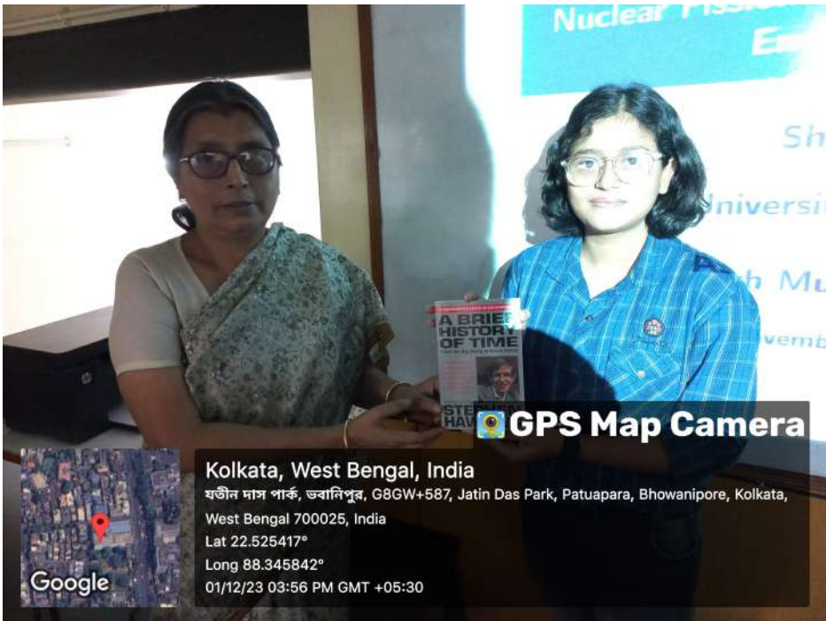
1 st Prize for Best Presentation in the event