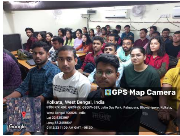
Students listening to Batchmate's presentations on pedagogical research topics