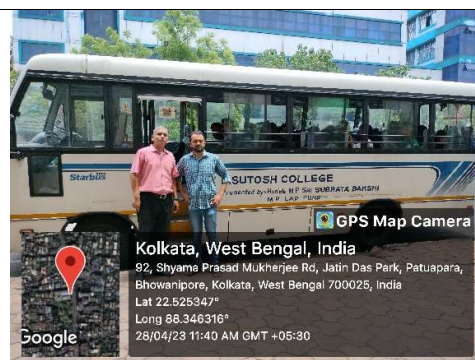
With the Bus in front of College