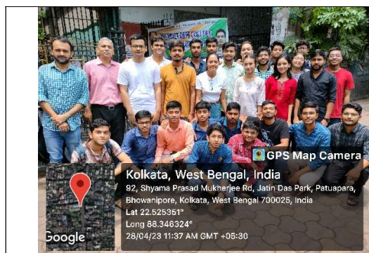
In front of Asutosh College