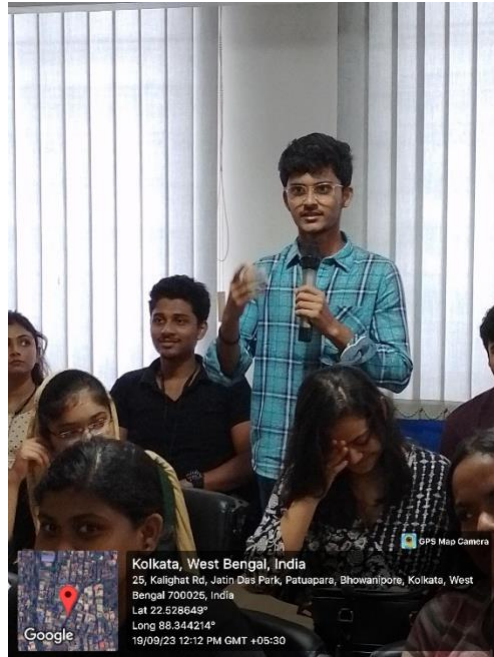
Students interacting with the speakers during the interactive session