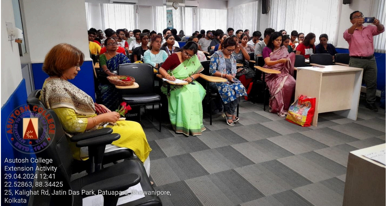
Asutosh College Extension Activity 29.04.2024 12:41 22.52863, 88.34425 25, Kalighat Rd, Jatin Das Park, Patuapara, Bhowanipore, Kolkata