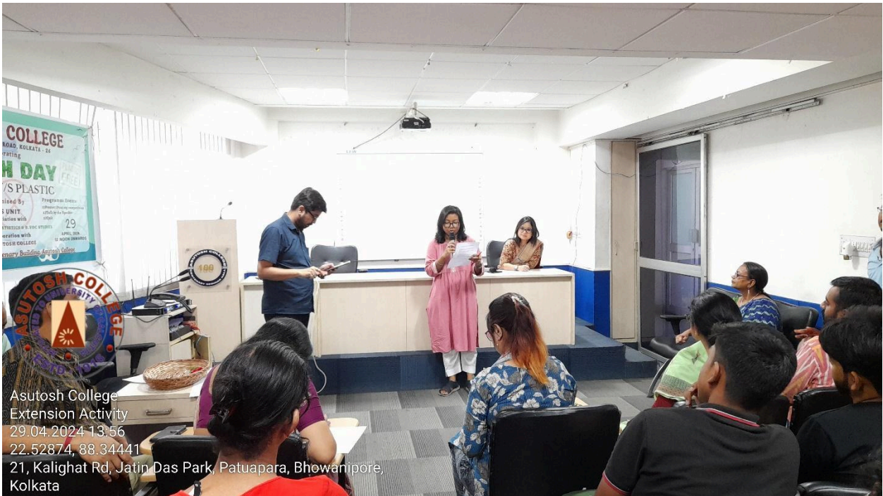
Asutosh College Extension Activity 29.04.2024 13:56 22.52874, 88.34441 21, Kalighat Rd, Jatin Das Park, Patuapara, Bhowanipore, Kolkata