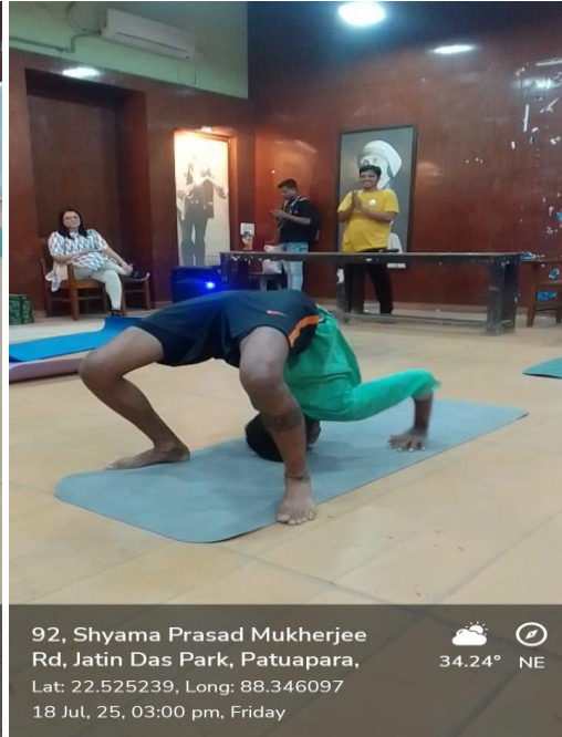
92, Shyama Prasad Mukherjee Rd, Jatin Das Park, Patuapara, Lat: 22.525239, Long: 88.346097 18 Jul, 25, 03:00 pm, Friday