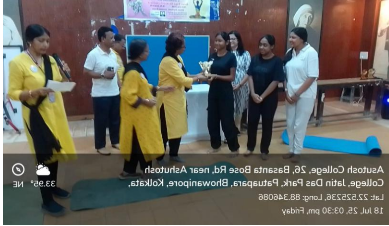
Asutosh College, 26, Basanta Bose Rd, near Ashutosh College Jatin Das Park, Patuapara, Bhowanipore, Kolkata, Lat: 22.525236, Long: 88.346092 18 Jul, 25, 03:30 pm, Friday