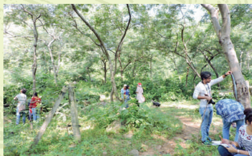
Students are doing ecology field work