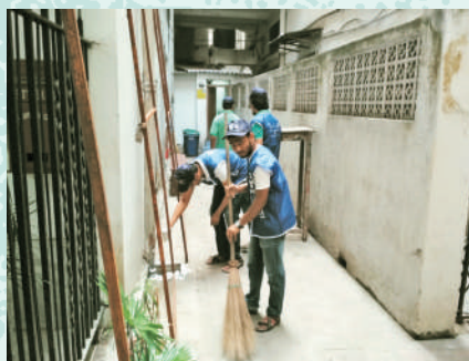
27 August, 2018 Dengue Awareness - organised by NSS Unit & Students' Union.