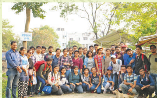
Students at East Calcutta Wetland for field work