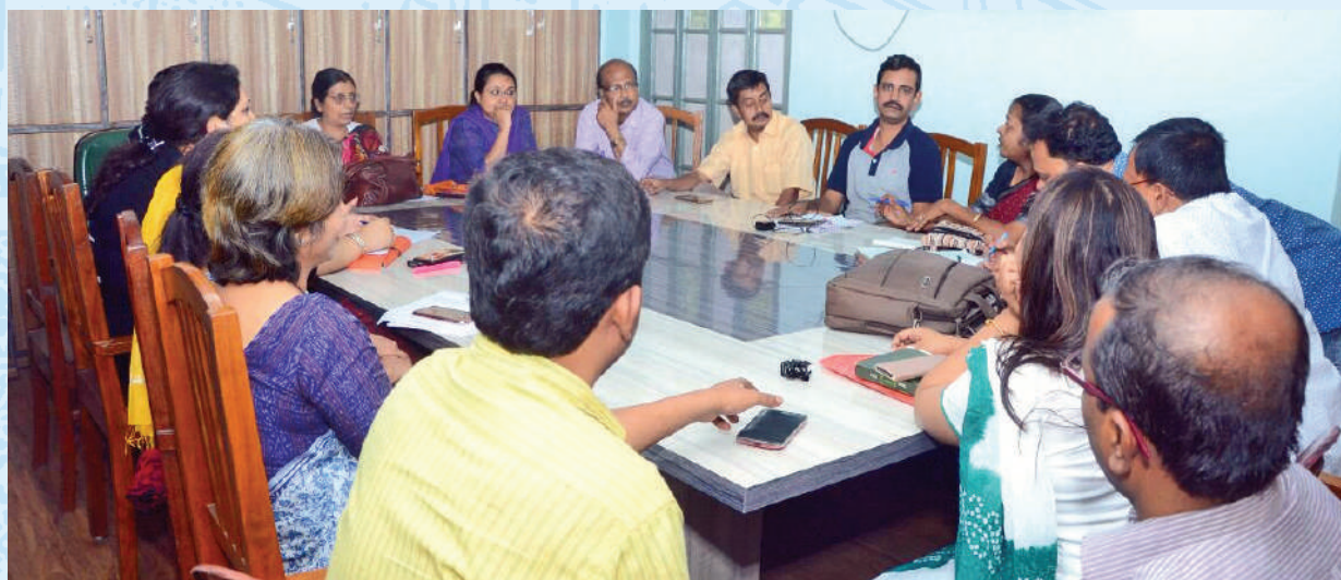
IQAC meeting in progress