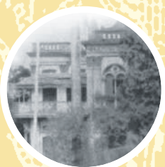
Bijni House (1917-35)