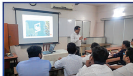
Extension lecture on Business Ethics Topic: The Role of SEBI as a regulator in Corporate Governance. Conducted by : Department of BBA Dated : March 23 , 2019