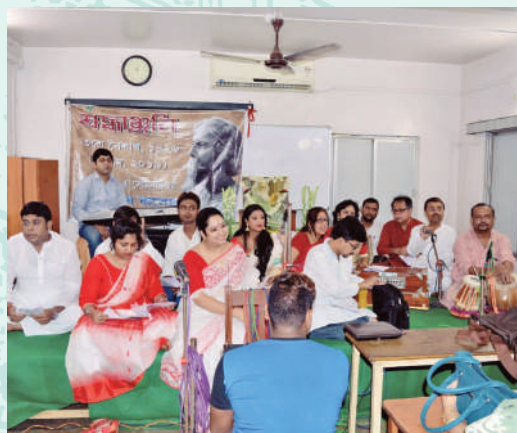
Rabindra Jayanti Celebration.