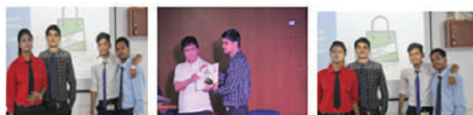
Students' Outreach Activities UEM University_IEM Competition : Advertisement Making Students of BBA (H) Part I Semester II 2019