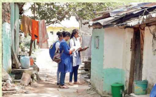
Questionnaire survey by students of Department of Environmental Science