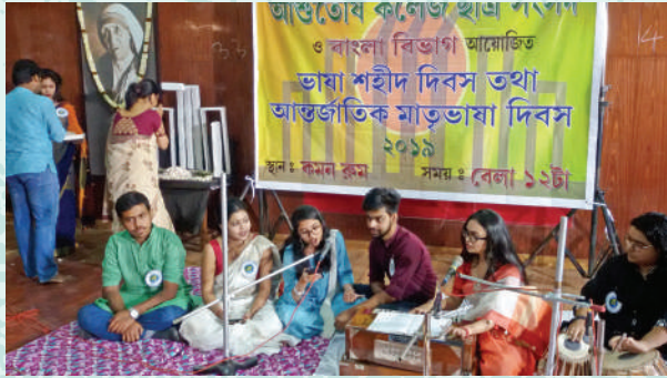
Observing Bhasha Sahid Dibas or International Mother Language Day.