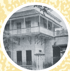
South Suburban College Building (1916-17)

Evening Department of Commerce opened and renamed Syamaprasad College in 1958.