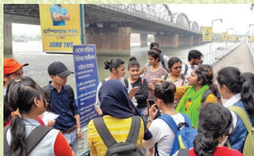
Departmental faculty explaining about Ganges river pollution