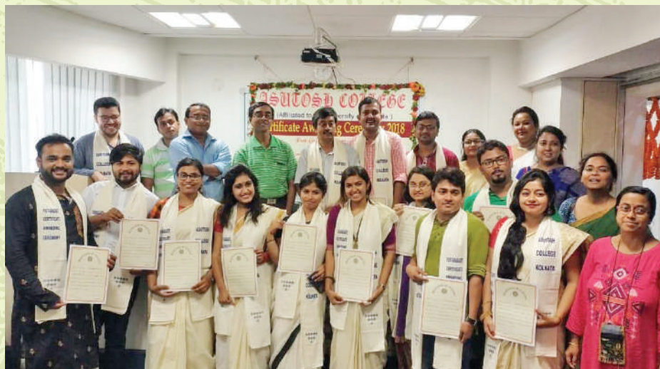
Postgraduate Students, Batch of 2018