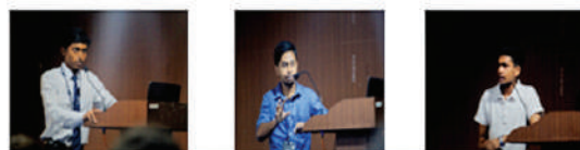
Students' Outreach Activities UEM University_IEM Competition : Business Plan Making Students of BBA (H) Part I Semester II 2019