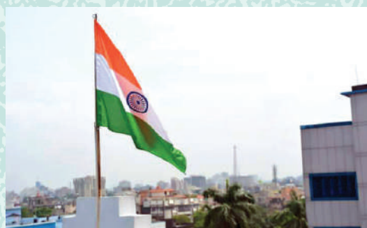
15 August, 2018 Independence Day celebrations and Flag hoisting ceremony.